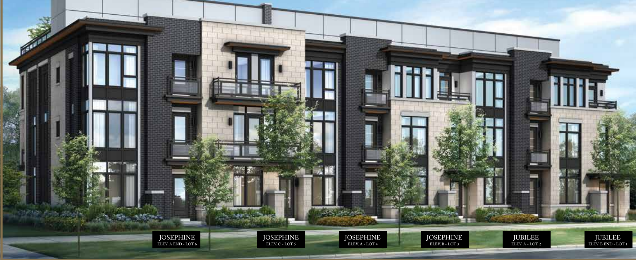
BLOCK 1 | FRONT