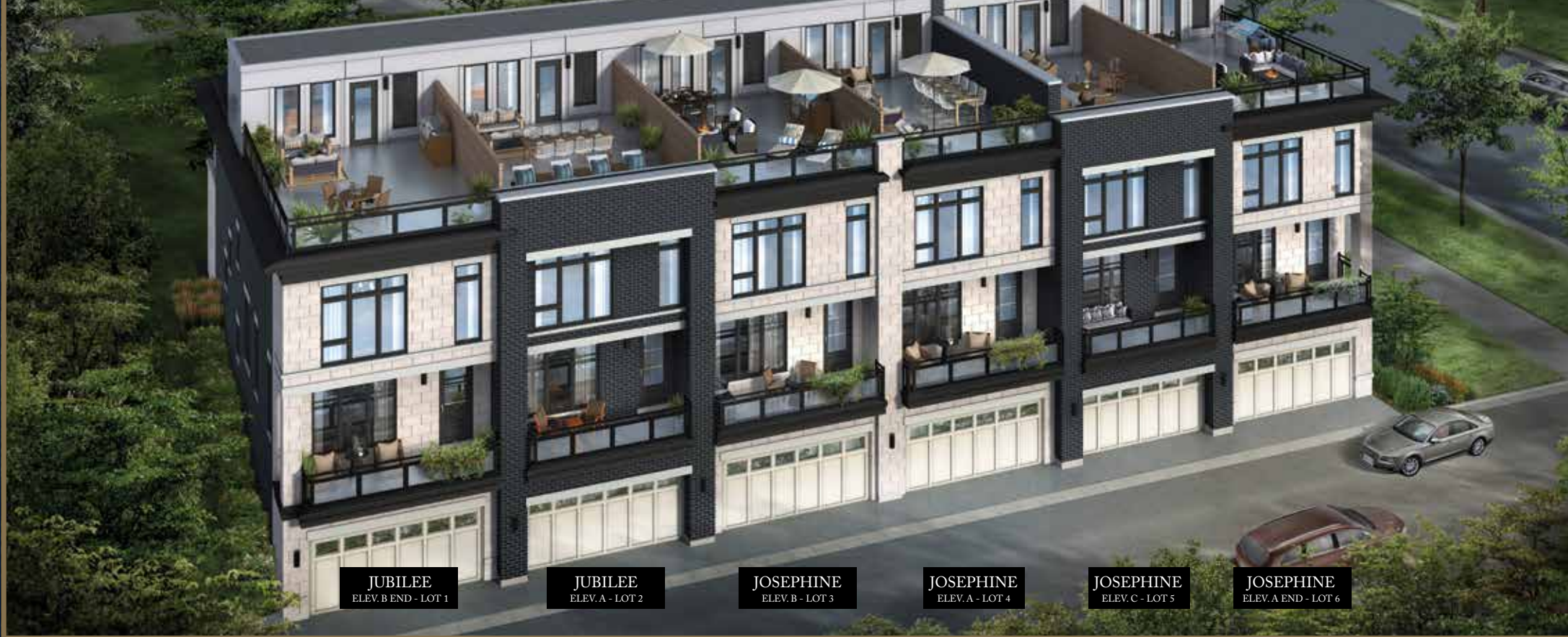
BLOCK 1 | REAR