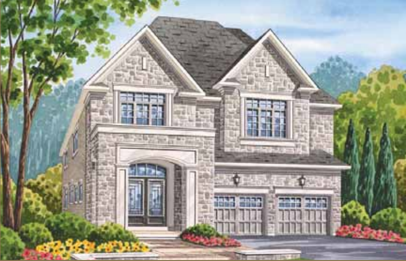
{ ELEV A }

2469 sq. ft. { ELEV A } 2467 sq. ft. { ELEV B } { includes 72 sq. ft. finished foyer in basement }