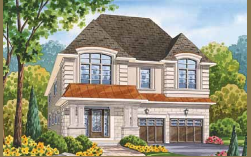
{ ELEV B }

Materials, specifications, and floor plans are subject to change without notice. All house renderings are artist's conceptions. All floor plans are approximate dimensions. Actual usable floor space may vary from the stated floor area. E.A. O.E. 5800