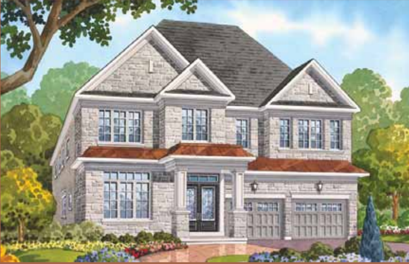
{ ELEV A }

3284 sq. ft. { ELEV A } 3294 sq. ft. { ELEV B } { includes 59 sq. ft. finished foyer in basement }