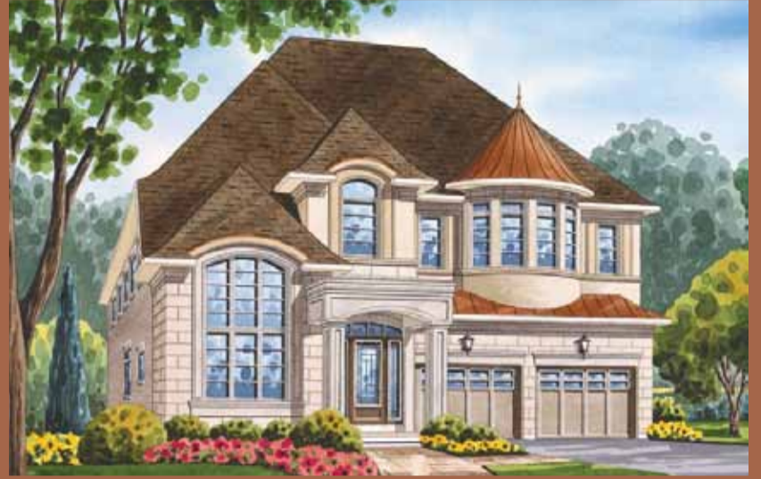
{ ELEV B }

Materials, specifications, and floor plans are subject to change without notice. All house renderings are artist's conceptions. All floor plans are approximate dimensions. Actual usable floor space may vary from the stated floor area. E & O.E. 4301