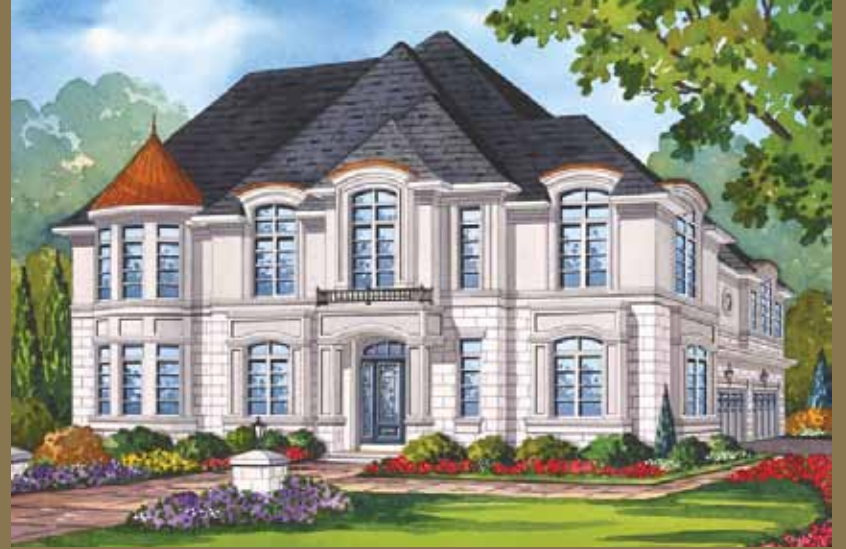
{ ELEV B }

Materials, specifications, and floor plans are subject to change without notice. All house renderings are artist's conceptions. All floor plans are approximate dimensions. Actual usable floor space may vary from the stated floor area. E.&O.E. 3805 CORNER