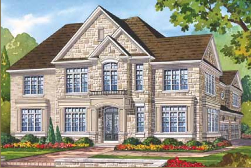
{ ELEV A }