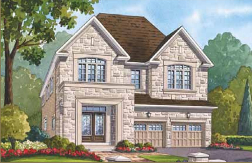
{ ELEV A }

3029 sq. ft. { ELEV A } 3031 sq. ft. { ELEV B } { includes 142 sq. ft. finished foyer in basement }