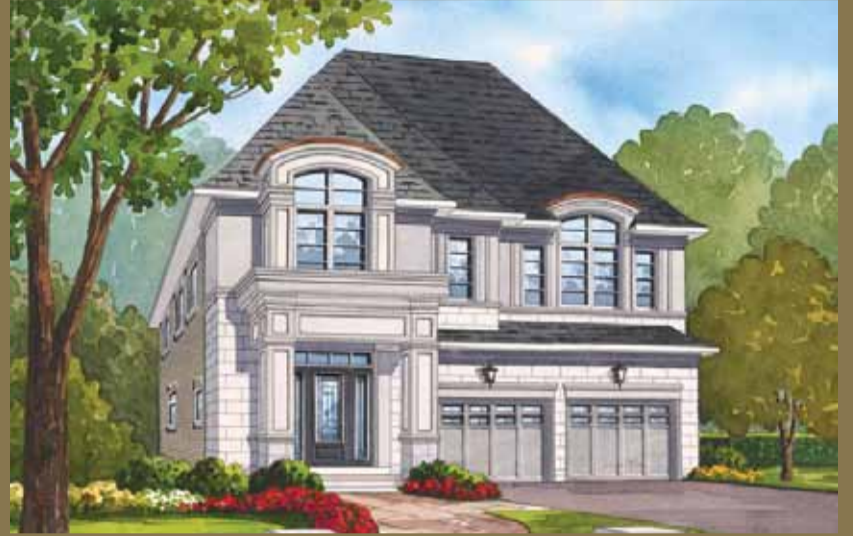
{ ELEV B }

Materials, specifications, and floor plans are subject to change without notice. All house renderings are artist's conceptions. All floor plans are approximate dimensions. Actual usable floor space may vary from the stated floor area. E.A. O.E. 3803